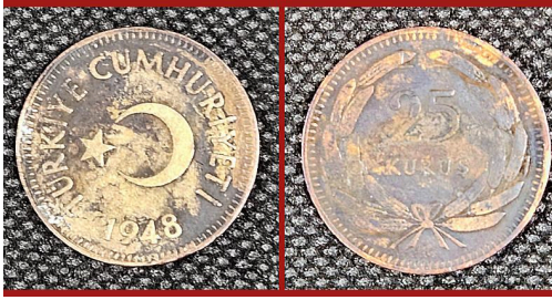
Coin Single Leilani Rodriguez