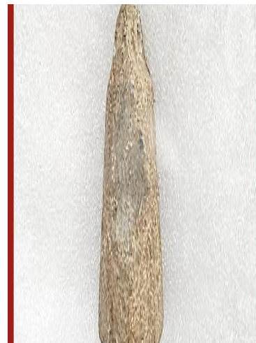
Odds & Ends Single Marc Hoover