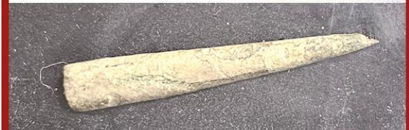
Artifact Single Marc Hoover