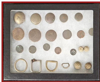
Display of the Month Marc Hoover