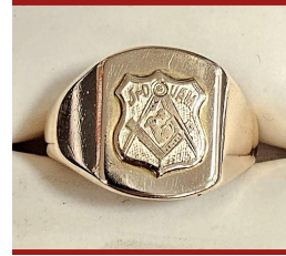
Jewelry Single Gary Flatt