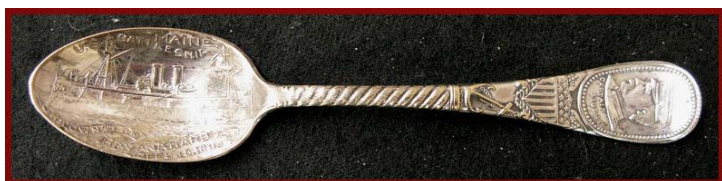
Group Odds/Ends - Bill Green