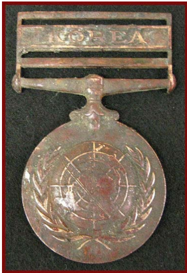
Single Artifact - Greg Watson