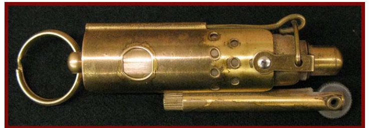
Group Odds/Ends - Gene Jenkins