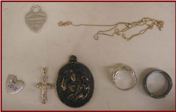
Single Artifact - Greg Watson