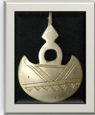
Single Odds/Ends - Paul Swaney