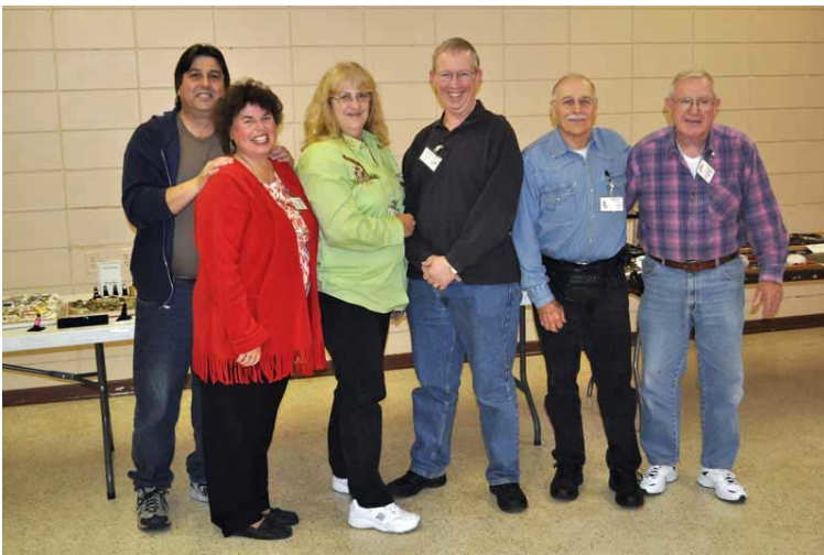
Finds of the Year winners