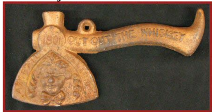
Single Odds/Ends - Bill Green