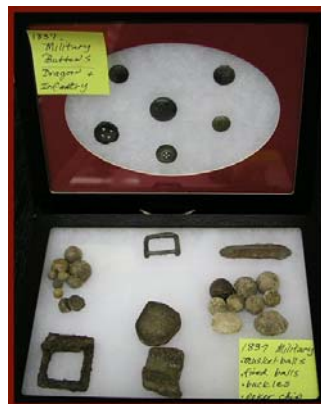
Single Odds/Ends - Bill Green