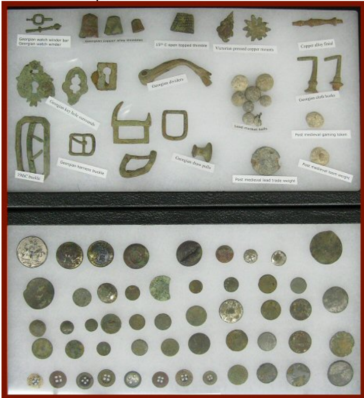
Group Artifacts - Chuck Hosbein