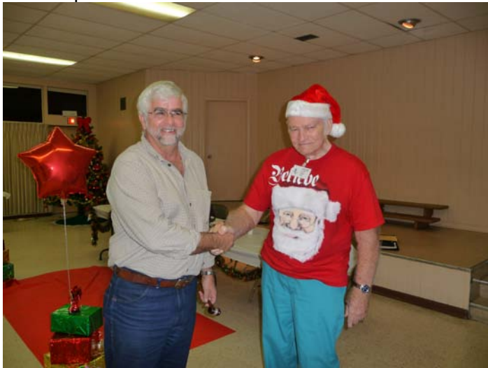
New club officers are as follows: