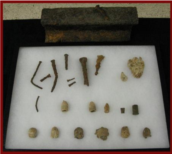
Group Artifacts - Jim Tippitt