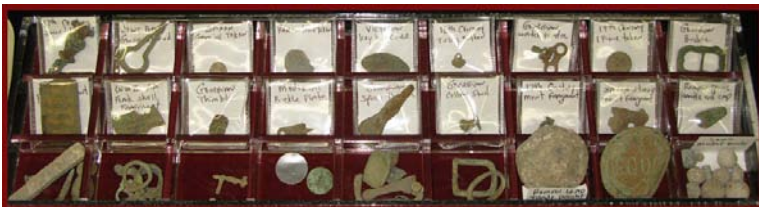
Single Odds/Ends - Bill Green