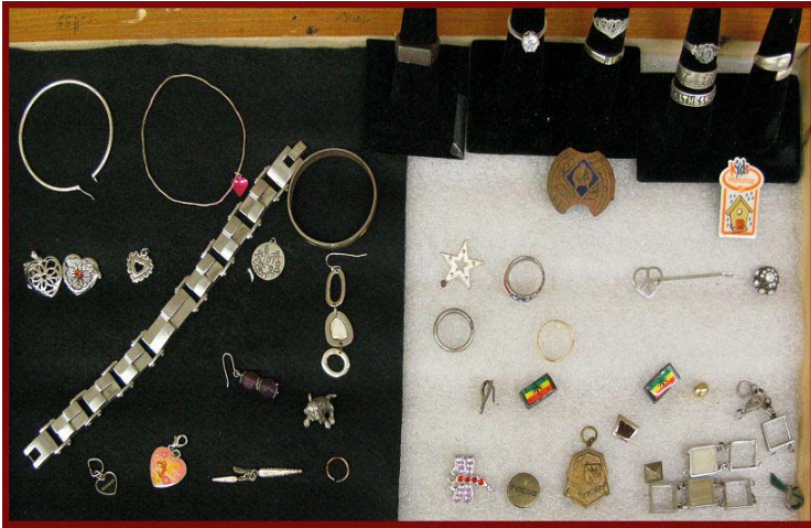
Single Artifact - Rob Hill