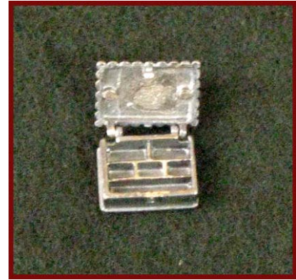
Group Odds/Ends - George Case