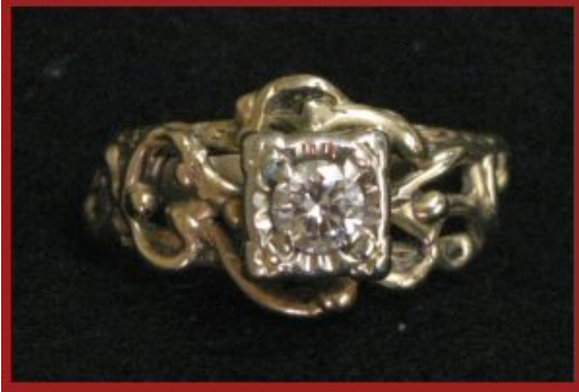
Single Jewelry - Betty Shackelford