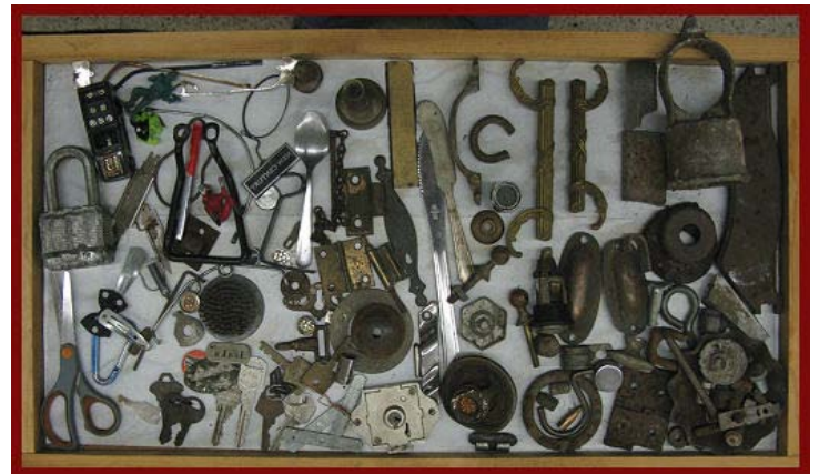
Group Odds/Ends - George Case