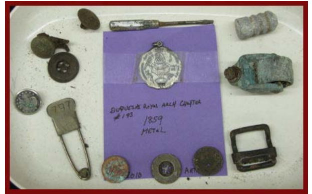
Single Odds/Ends - Bill Green